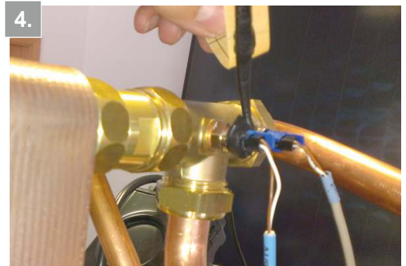
4. and twist it around the sensor