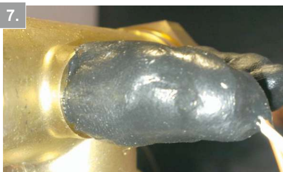
7. after 24h the material has created a shining layer