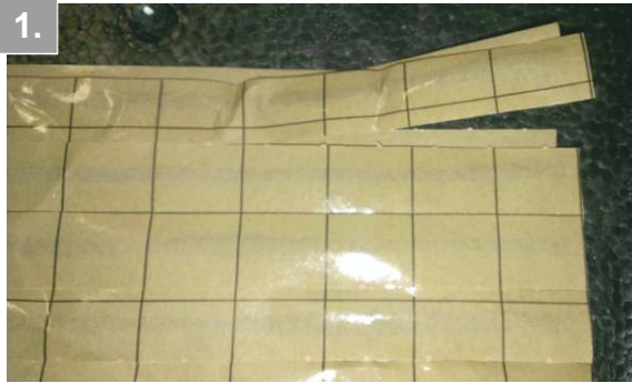
1. separate the single stripes at the perforated mark ( no tool necessary )