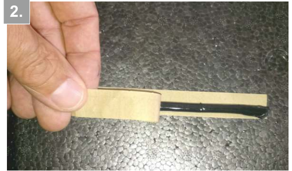
2. loose the paper from one side