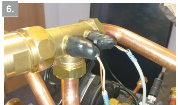
6. close all gaps and tight it up