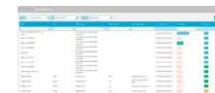
5. Follow up of alarm and fault prediction