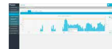
4. Detailed energy consumption follow up