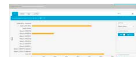
3. Compare energy use from multiple sites