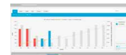
2. Compare energy use with target