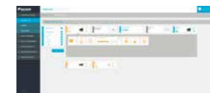
1. Monitor and control your system