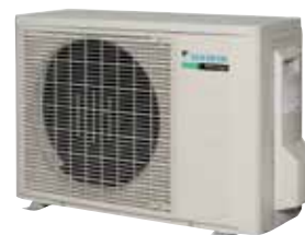
Outdoor unit RXS25-35L

Daikin has a worldwide reputation based on 90 years' experience in the successful manufacture of high quality air conditioning equipment for residential, commercial and industrial use and 56 years as a leader in heat pump technology.