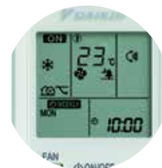
Infrared remote control (Standard) ARC452A1