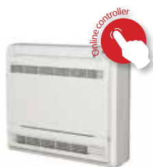
Indoor unit FVXS25,35,50F

(1) EER/COP according to Eurovent 2012, for use outside EU only.