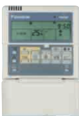
Wired remote control (Optional)

The function ceases to operate when the room temperature reaches 15°C and should also be switched off when the occupant returns home.